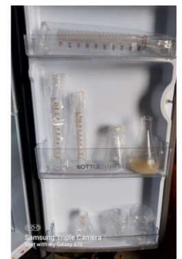
On-farm lab set up with the support of ICAR-CCARI