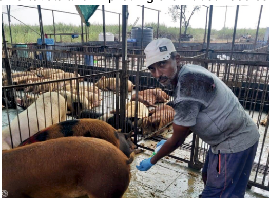
Performing pig AI in farm